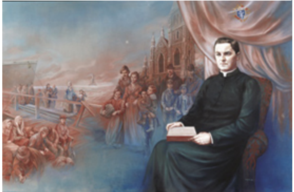
Father Michael Mc Givney Founder of the Knights of Columbus

KNIGHTS OF COLUMBUS Bishop Charles McLaughlin COUNCIL 7282 DISTRICT 47